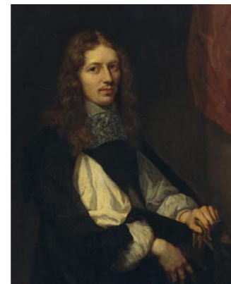
Pieter de Graeff in 1663, geschilderd door Caspar Netscher